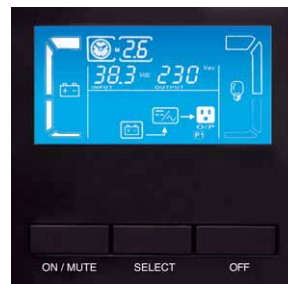
Multifunction LCD display

The UPS range EVO DSP is designed in accordance with the highest environment protection standards. The high efficiency and low harmonic inputs guarantee the uppermost respect for the environment.