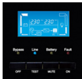
Multifunction LCD display

The UPS range EVO DSP is designed in accordance with the highest environment protection standards. The high efficiency and low harmonic inputs guarantee the uppermost respect for the environment.